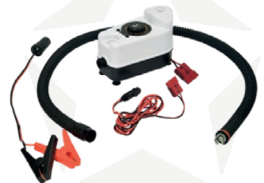
ELECTRIC PUMP PREMIUM 12V

ELECTRIC PUMP MAKES INFLATING STARX FLAGS EASIER AND FASTER, BUT DOES NOT HAVE A PRESSURE GAUGE TO CONTROL PRESSURE, AND/OR DO NOT GENERATE ENOUGH PRESSURE TO FULLY INFLATE THE FLAG, SO THE LAST STAGE OF INFLATION SHOULD BE DONE WITH A OSS16 HAND PUMP - FOR DETAILS SEE STARX PRODUCT MANUAL