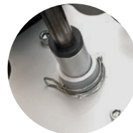
ROTATING PART SEPARATE FOR THE BASES