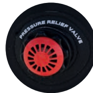
PRESSURE RELIEF (OVERPRESSURE) VALVE