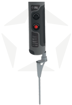
HAMMER BASE WITH ROTATOR

* Recommended for STARX FLAG up to 6m height, or for all sizes indoor. **Recommended for STARX FLAG up to 8m height. ***Set consists of 4 pcs weights - (4 weights inkl. Polybags - can be filled with sand)