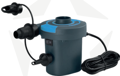
ELECTRIC PUMP STANDARD 12V+230V