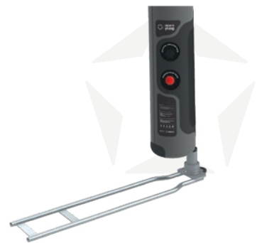
DRIVE-ON BASE WITH ROTATOR