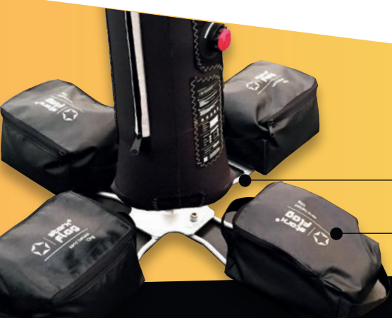
CROSS BASE WITH ROTATOR