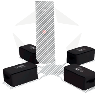
WEIGHTS FOR THE CROSS BASE