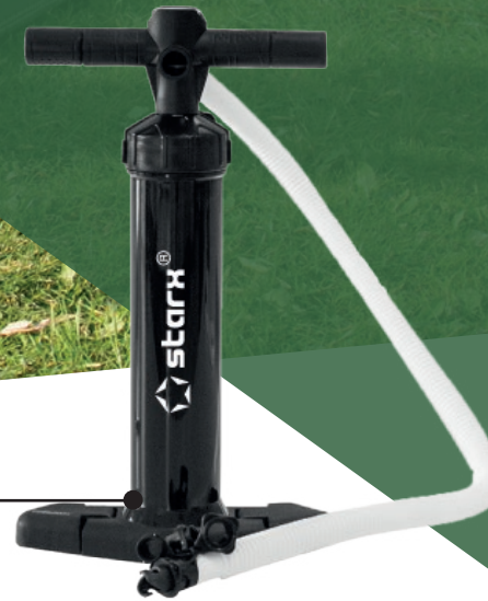
MANUAL PUMP PREMIUM OSS16