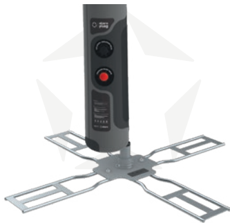
CROSS BASE WITH ROTATOR